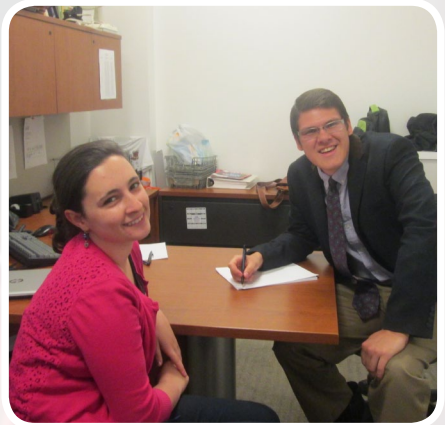
Tutoring and Academic Success Center