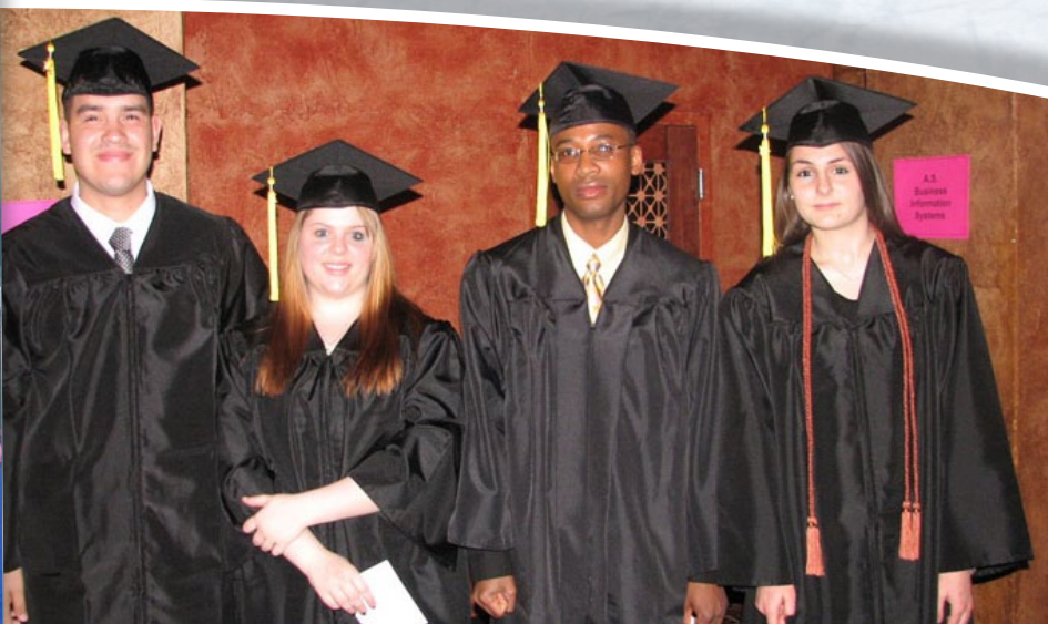
Three Rivers graduates from the Class of 2014.