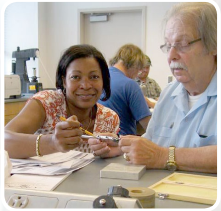
TRCC Workforce and Community Education Students

The TRC Foundation provided 33 students with partial funding for tuition, textbooks and/or required uniforms that were enrolled in high demand programs to fast-track students into sustainable careers. Funds were used for non-credit certificate programs.