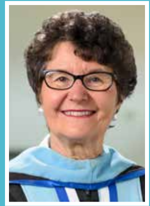
Message from the President of Three Rivers Community College