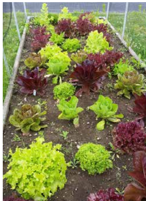
TRCC vegetable garden

The TRC Foundation and Community Foundation have formed a partnership that benefits the educational goals of our students and shared community. Grant and scholarship support totaling $30,000 provided scholarships for tuition, books, and other educational needs as well as support for students in Workforce and Continuing Education with training programs that give students the skills to not only get a job but put them on a path to a lifetime career. Funding also supported TRCC's Environmental Engineering Technology Project that targets historically under-represented student populations to increase their enrollment, retention, and graduation in STEM programs and specifically issues pertaining to the environment.