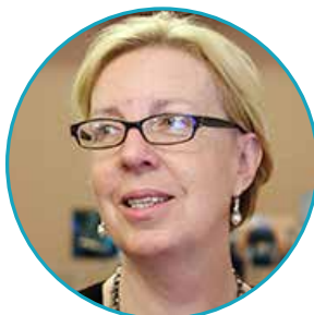
Senator Cathy Osten CT State Senator