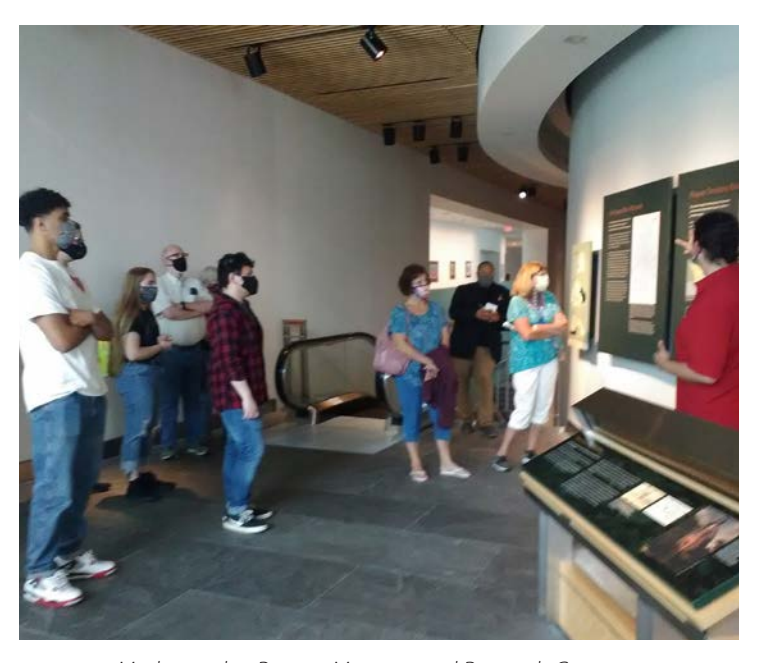
Mashantucket Pequot Museum and Research Center

The Community Foundation of Eastern CT continued to invest in Three Rivers' Environmental Research, Fieldwork, and Hands-on Learning Internship which provides vital educational opportunities in the rapidly growing world of environmental studies. The program focuses on supporting first-generation, nontraditional, and historically under-represented student populations to increase their enrollment, retention, and graduation in STEM programs and specifically issues pertaining to the environment.