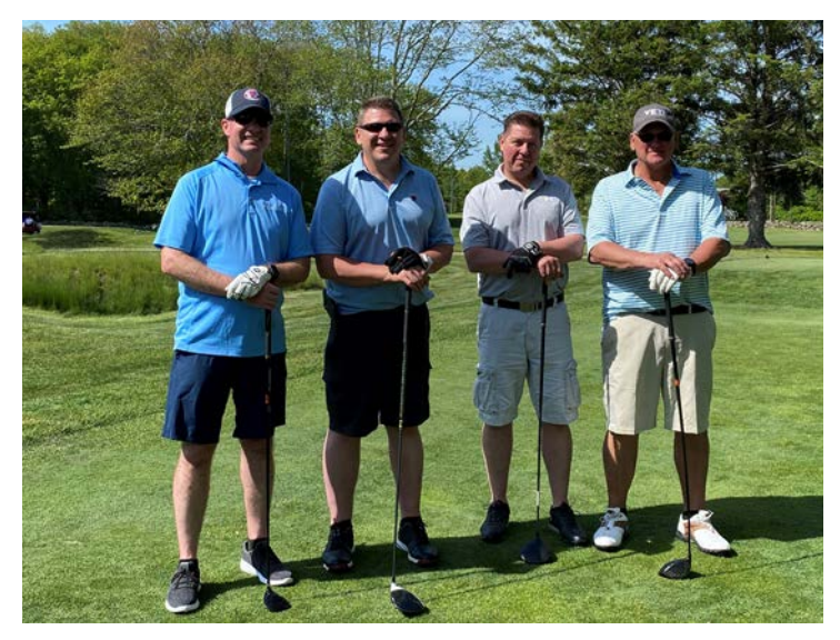
Team P & D Mechanical