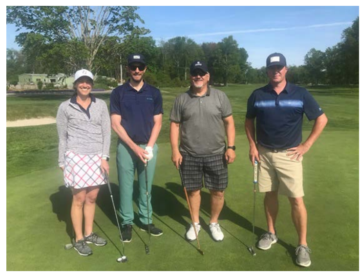
Team Backus Hospital