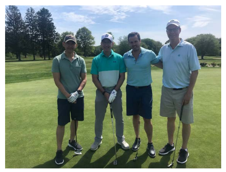
Team L+M Hospital