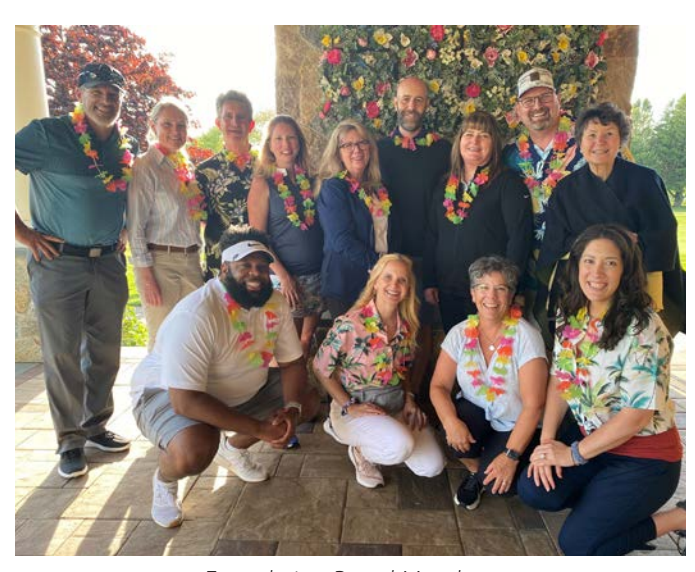
Foundation Board Members