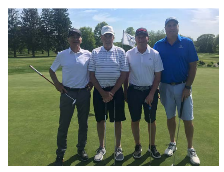
Team General Dynamics/Electric Boat