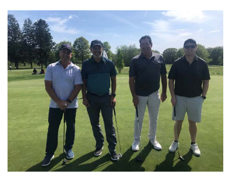
Team Dominion Energy