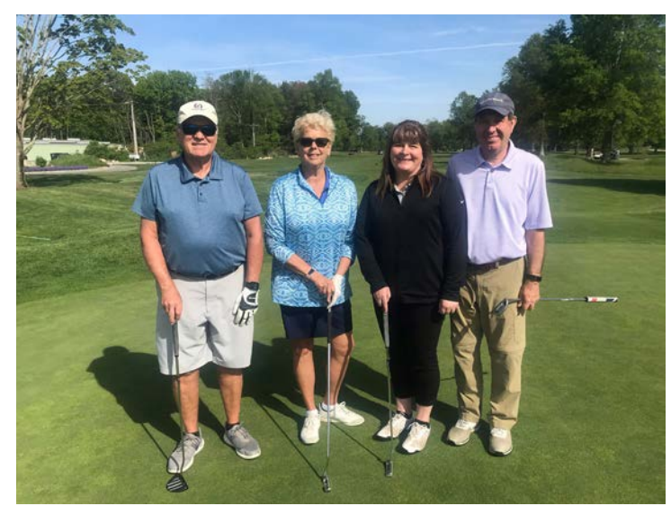
Team Chelsea Groton Bank