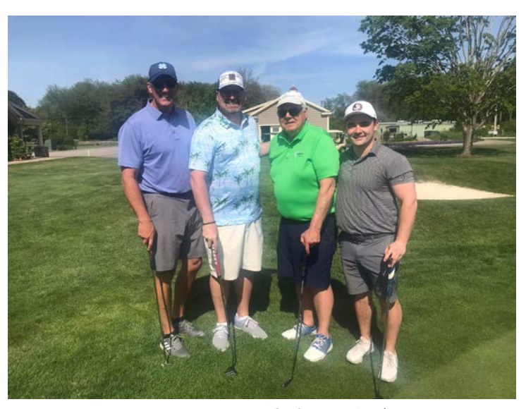
Team Eastern CT Savings Bank