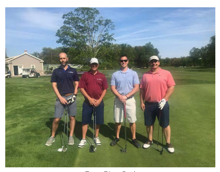
Team Dime Bank

SAVE THE DATE 25th Annual Golf Classic May 22, 2023