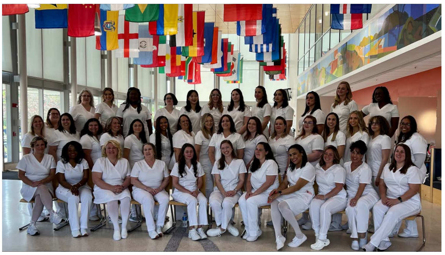
2023 Three Rivers Community College Nursing Graduates